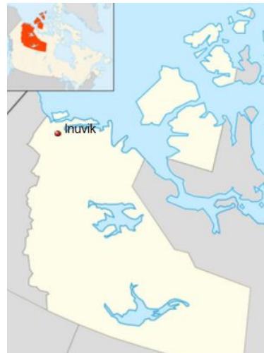
Figure 1. Inuvik, Northwest Territories.

improved patient outcomes. 4 Including Canada's, there are 71 registries in the world, allowing transplant coordinators to search through 22 million potential stem cell donors from across the world to find a genetic match for their patients.