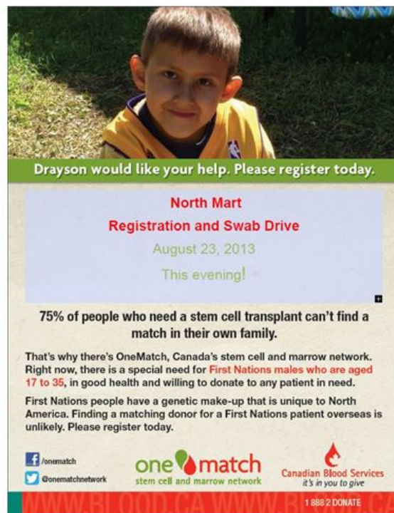
Figure 3. Sample Advertising Campaign Resources for a Rural Stem Cell Drive. Left: Social Media Campaign. Right: Printed Poster Targeting Aboriginal Demographic