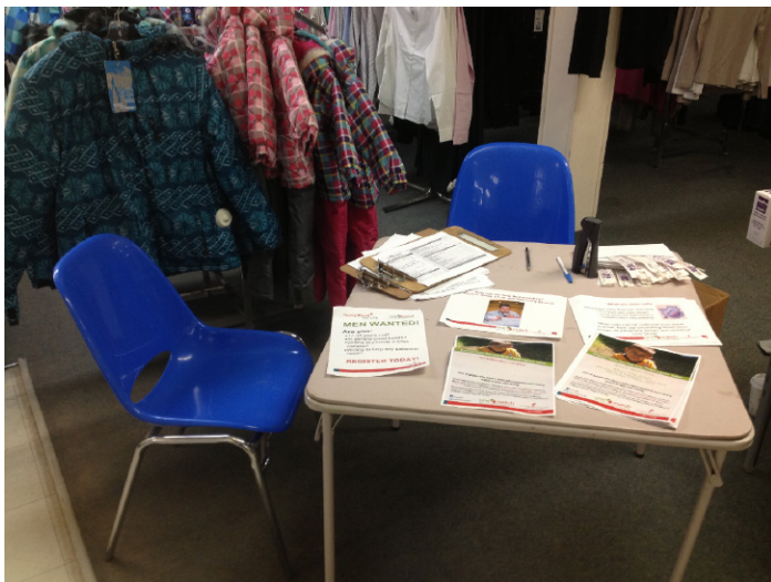
Figure 2. Rural Stem Cell Drive Setup: featuring posters, information pamphlets, swab kits, consent forms, and required office supplies. Photo was taken during rural stem cell drive pilot in Inuvik, Northwest Territories, August 2013, at NorthMART Community Store.

engage the community of Inuvik with the stem cell network by hosting a stem cell drive.